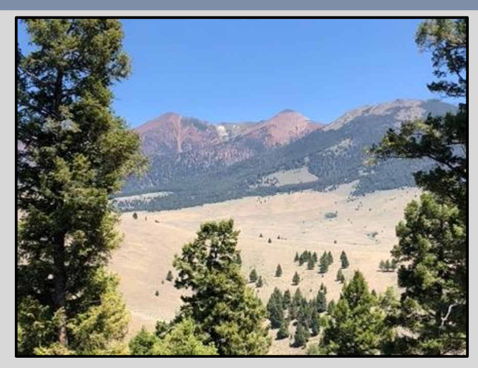
19.6 acres of land bordering State Lands on two sides at the end of the gated road with elk and deer hunting, trees, and amazing Highland Mountain views.

This Montana hunting property borders State Lands on two sides out in the mountains of Montana. You've got all these extra public lands right next to your property that you can just take off and hunt too. It's a huge bonus to have these lands right there next to you to hunt and recreate on. Set up stands and hunt your own property for elk and deer or take off after them wherever they may be roaming for the day. You'll hear elk bugling in the fall and you can glass the open parks and hillsides right from your property and go hunt them from there. You can hunt both elk and deer with a general tag and there's extra cow elk tags you can draw for a second elk as well since the elk are so plentiful in Hunting District 340. There's thousands and thousands of acres of BLM lands in the area and it's only a few miles back up the road to the National Forest as well for tens of thousands of more acres you can hunt and explore in the Highland Mountains. There's lots of country that's yours to enjoy right at your fingertips, and its wide-open spaces for you to have and enjoy for decades to come.